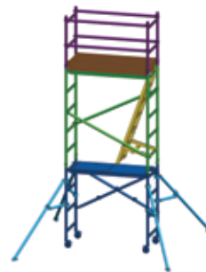
CONFIGURATION 3 PLATFORM HEIGHT 3.4m Base Pack + Extension Pack + Guard Rail Pack + Ladder + Toe Boards + Outrigger Pack