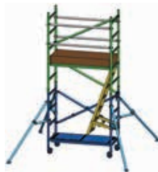
CONFIGURATION 2 PLATFORM HEIGHT 2.3m Base Pack + Extension Pack + Ladder + Horizontal Bracing + Toe Boards + Outrigger Pack