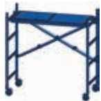
CONFIGURATION 1A PLATFORM HEIGHT 1.5m Base Pack

Colours indicate packs required to complete configuration