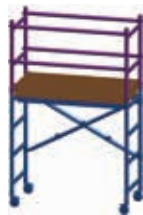
CONFIGURATION 1B PLATFORM HEIGHT 1.5m Base Pack + Guard Rail Pack